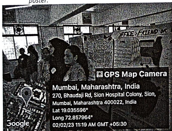
Figure 3 Participants of Inter Collegiate Poster Competition.